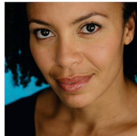
Eisa Davis Theatre