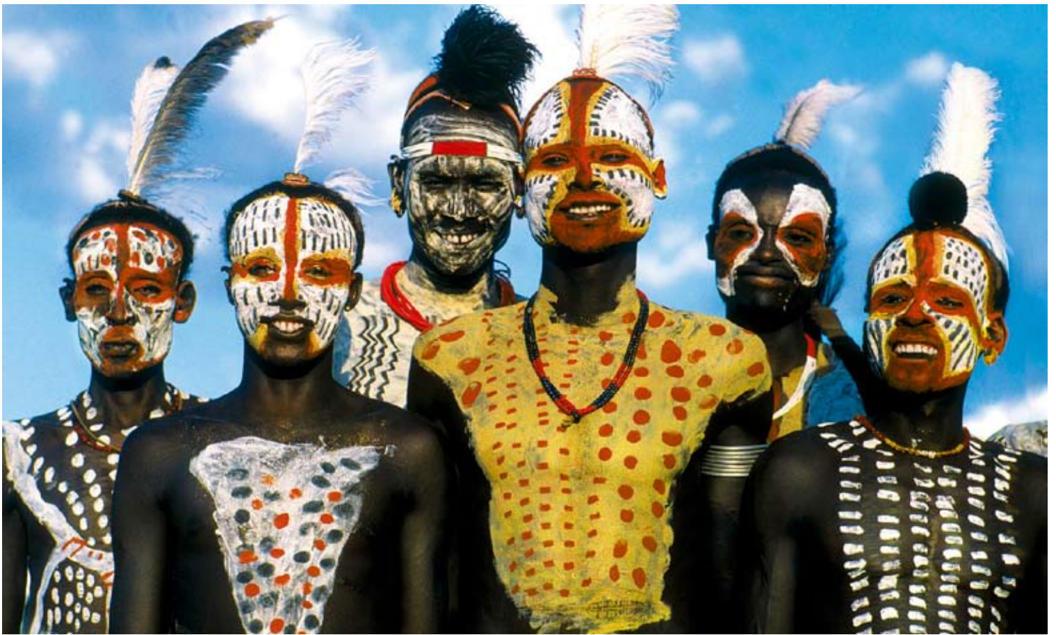
Karo Courtship Dancers, Ethiopia

marriage and motherhood. A journey back in time, the Dassanech still perform this age-old ceremony wearing black ostrich feather headdresses, leopard skins and colobus monkey capes. By night, Angela and Carol followed the men in dugout canoes hunting crocodiles.