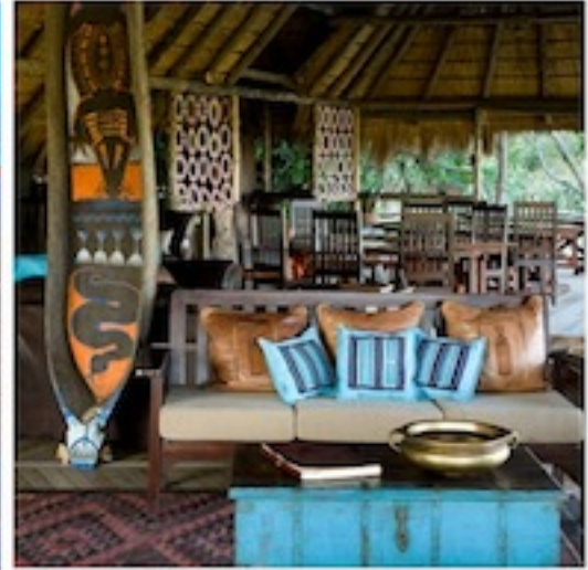
Clockwise from L to R: African art; Colonial trunk; outdoor lounge at Selinda Camp featuring Keith Joubert's art, Colonial furniture and African fabrics; banquette by candlelit pool at ol Donyo Lodge .