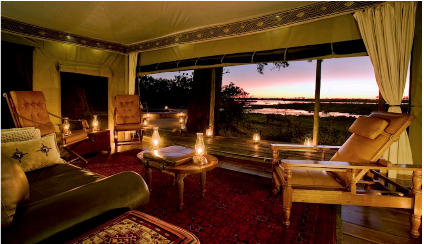
Custom canvas tent at Zarafa camp designed by Dereck Joubert and built by Canvas and Tent SA

The Great Plains camps are designed to showcase a collection of Colonial memorabilia and art installations. Unique custom canvas tents are hidden strategically around the large conservation areas of the camps, placed where guests can sit comfortably watching sunsets across the great plains and where wildlife and birds live without fear.