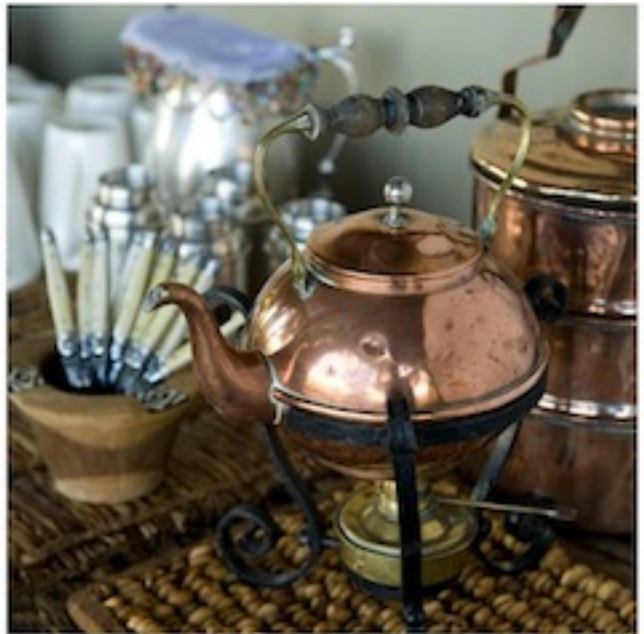
Clockwise from L to R: Colonial desk with memorabilia and fishing poles; Selinda and Zarafa Camps are located in the Selinda Reserve in Botswana; copper tea kettle; relaxing armchairs offer a stunning view of the reserve.