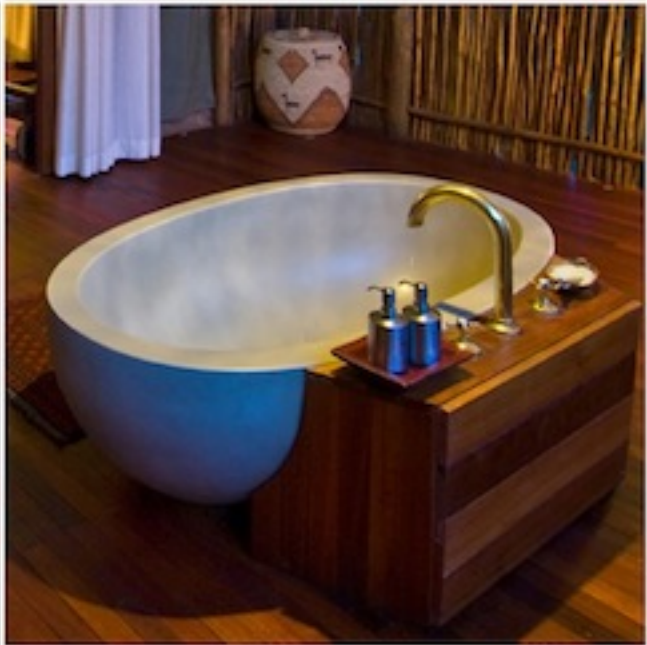
Clockwise from L to R: Antique African copper bathtub at Zarafa Camp ; bedroom suite with mahogany armchairs at Selinda Camp ; unwind in the luxurious Selinda Camp bathtubs; bedroom suite at Zarafa Camp features a handcrafted trunk, bedding from Gaborone and South African bolsters.