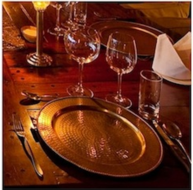
Clockwise from L to R: Breakfast tray with copper hurricane and South African china; wine cellar at Selinda Camp ; table setting with African handcrafted plate at ol Donyo Lodge ; picnic lunch at Zarafa Camp .