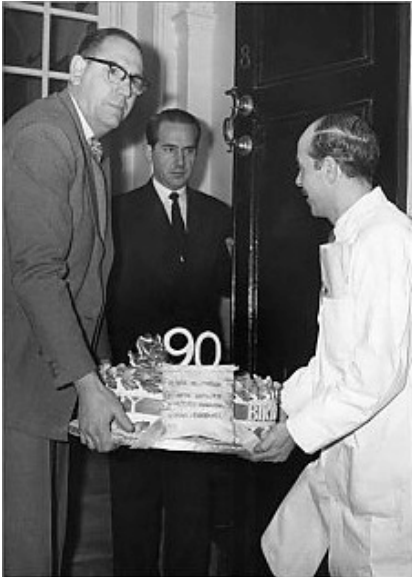
Churchill's 90 th Birthday Cake Delivered, 1964.