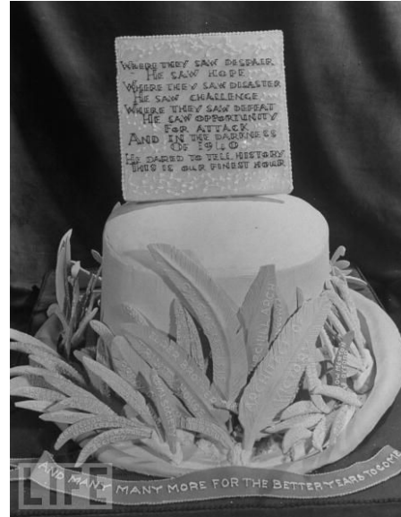
Churchill's Feather In His Cap Birthday Cake, 1951.